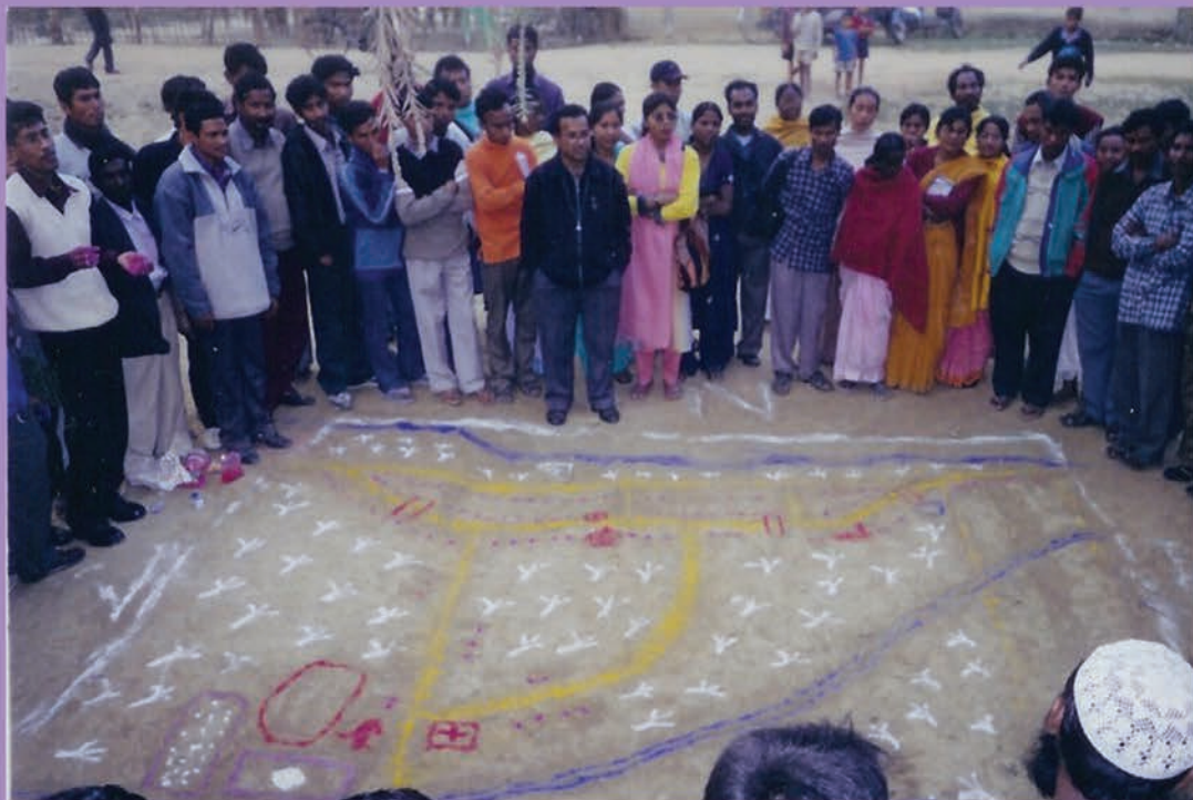
Rally being conducted as a part of the Awareness generation Programme in Lahorighat Block in Morigaon (above) Social Mapping exercise being carried out with the community as a part of Disaster preparedness programme