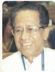
Shri Tarun Gogoi Hon'ble Chief Minister of Assam