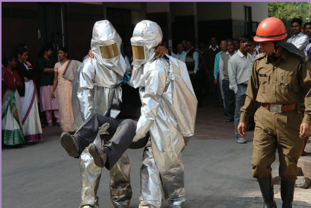
Mock Drills being carried out by the Fire Service Personell at the Assam Secretariate