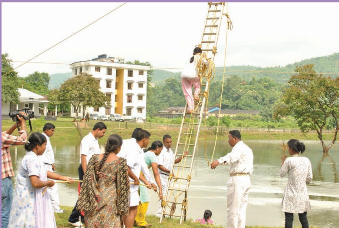
Training for the Women Masters Trainers in Search, Rescue and First Aid was organised by Assam State Disaster Management Authority