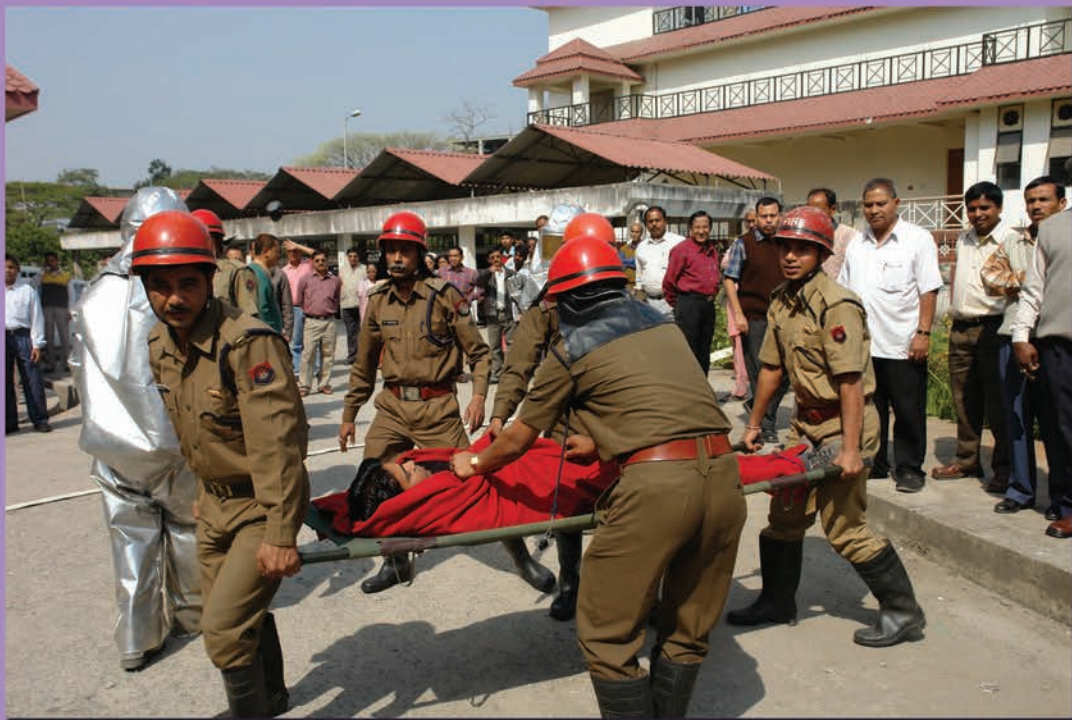
Mock Drills being carried out at the Assam Secretariate