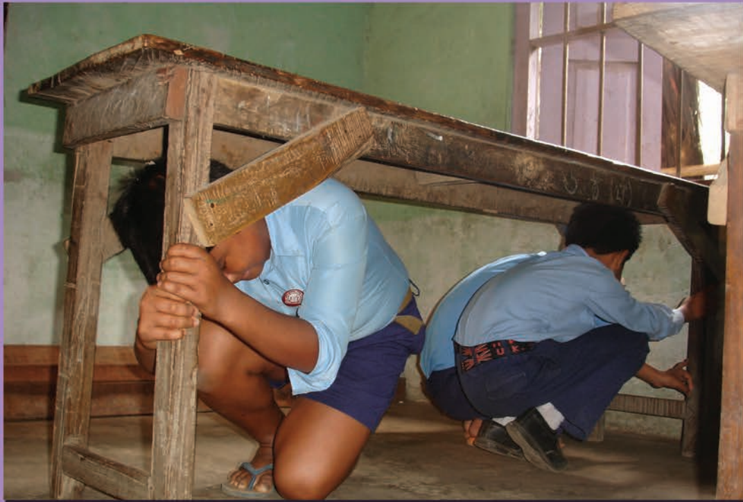
Mock drills being carried out at schools for the Great Assam Shake Outm Programme