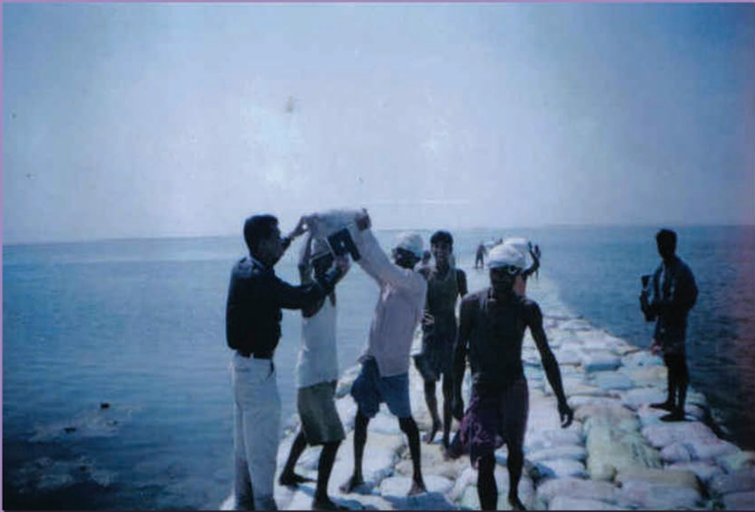
River Bank Protection by placing sand bags against breaches in Morigaon