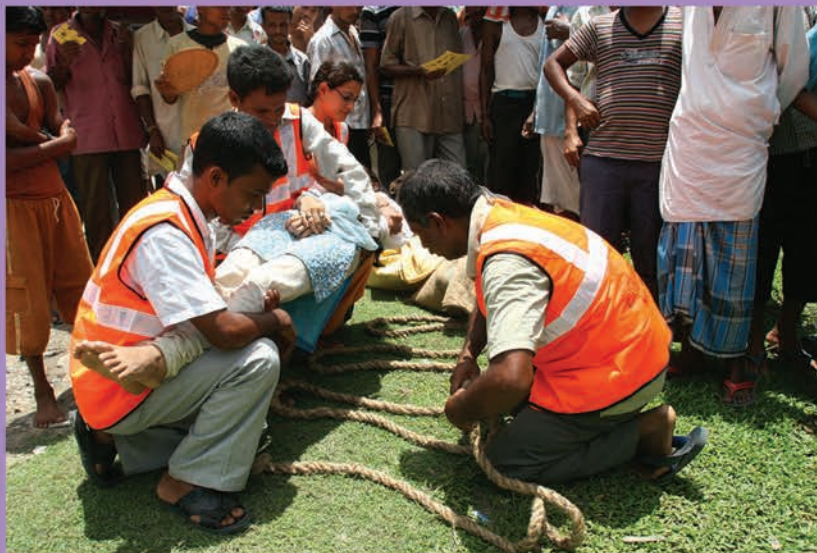
Rescue workers making stretchers using, chairs, rope and blankets. Women are encouraged to take part in the exercise