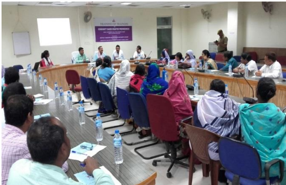
Figure:4 CDBP training in Dhubri