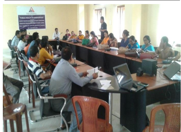
Figure:9 PHE training in Bongaigaon