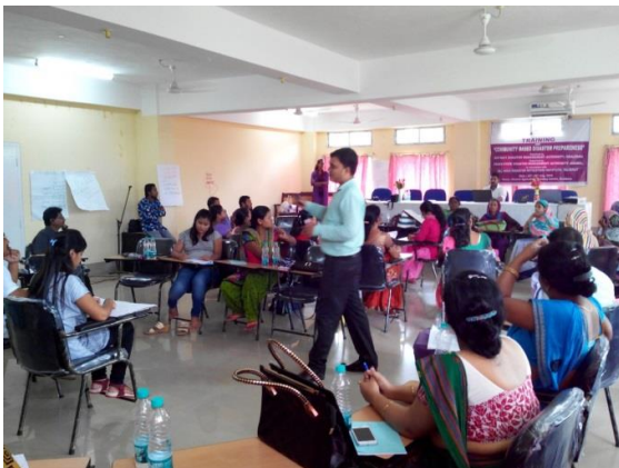
Figure:5 CDBP training in Goalpara