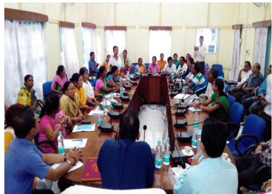
Figure:7 CDBP training in Kokrajhar