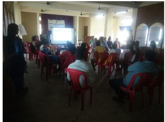
Figure:6 CDBP training in Kamrup (Metro)