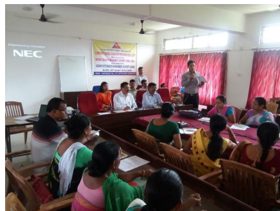
Figure:1 CBDP training in Baksa