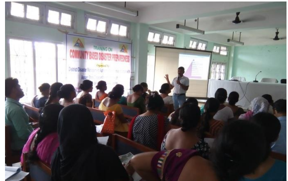
Figure:8 CDBP training in Nalbari