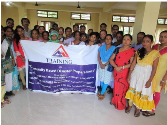
Figure:3 CDBP training in Bongaigaon