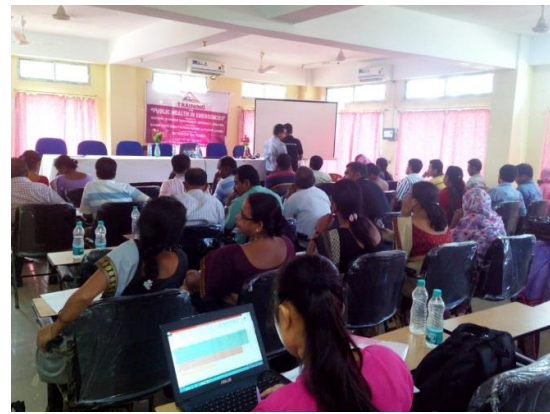
Figure:11 PHE Training in Goalpara

The trainings were conducted in the districts as per the following schedule