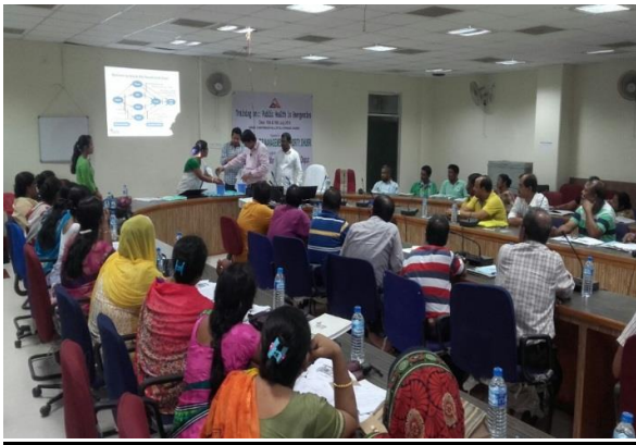
Figure:10 PHE Training in Dhubri