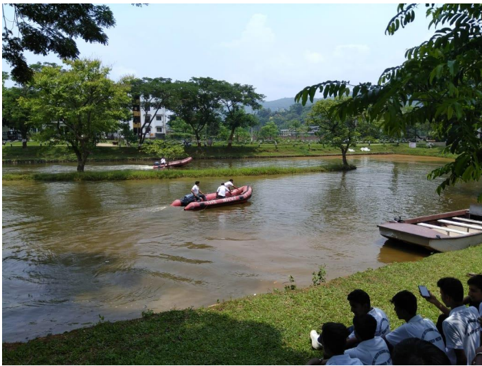
Practical Session Installation of IRB