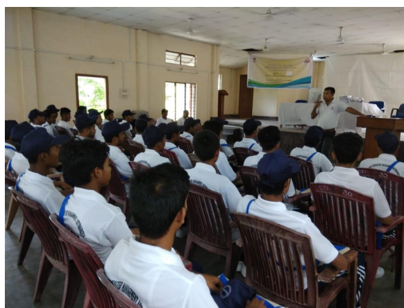
Theory Class of AAPDA MITRA Training