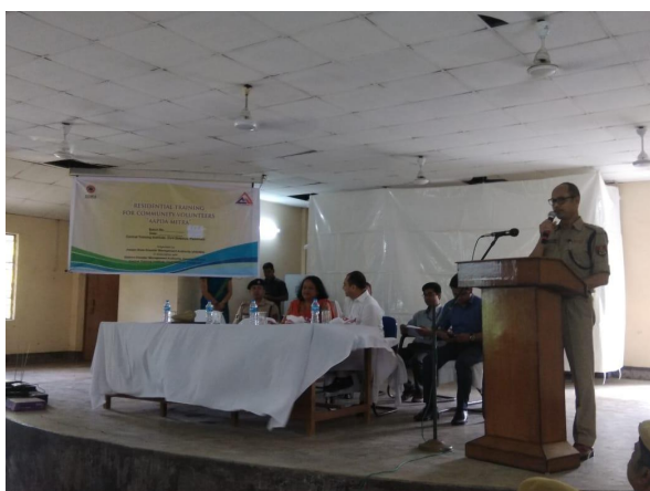
Inauguration of AAPDA MITRA Training