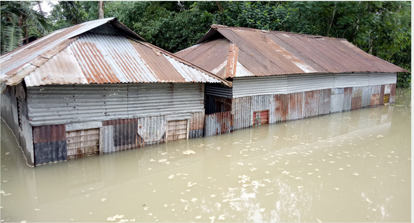
Flood affected areas.