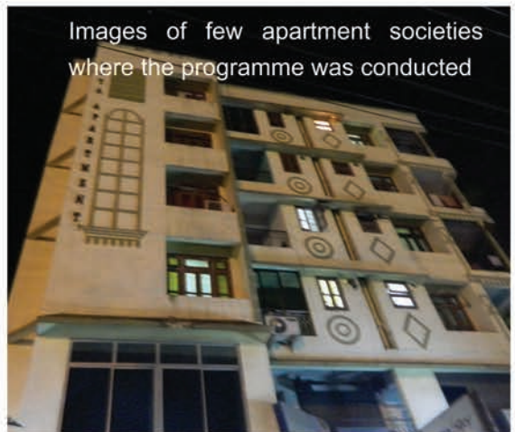
Images of few apartment societies where the programme was conducted