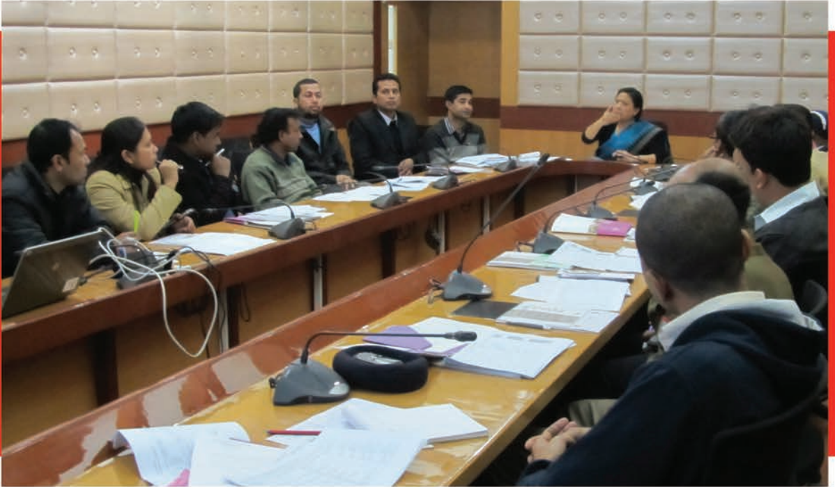
Discussions with the NGOs, Civil Defence, AFSO on the execution of the Programme

Feedback from State Fire Service Organisation which conducted Fire Safety Assessment in the apartment buildings