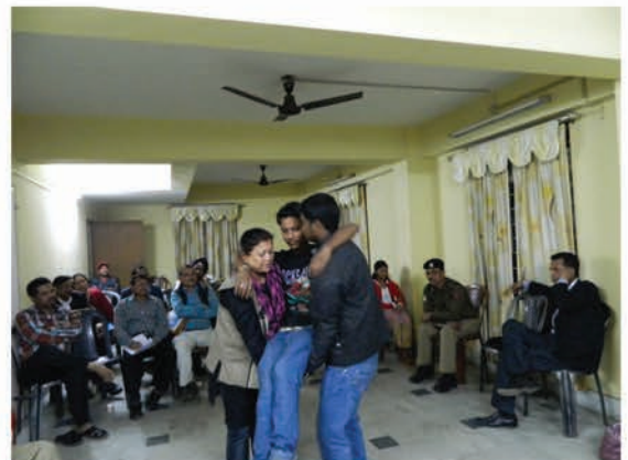
Sensitization programme being conducted at various Apartment Societies