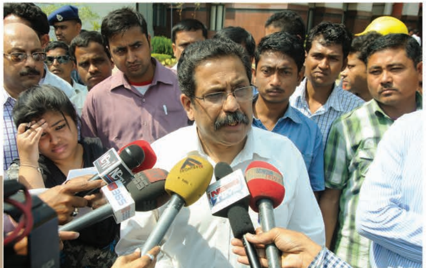
Commissioner & Secretary, SAD addressing the media