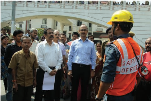
Safety Officer briefing the Commissioner & Secretary, SAD about the completion of the activity