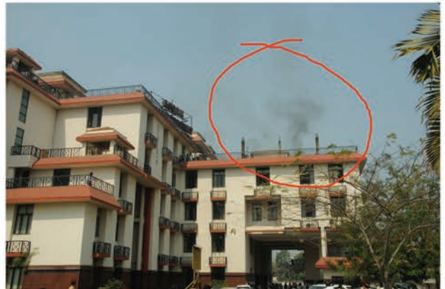
Smoke seen at Block A