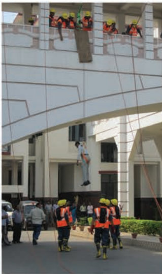
A victim being evacuated through rope rescue method