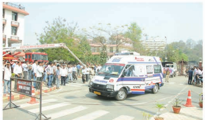
108 arrives at the scene