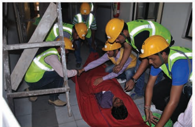
Civil Defence Volunteers with a victim