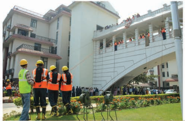
SDRF evacuating a victim out