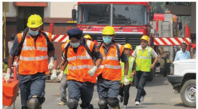
NDRF comes in to take command