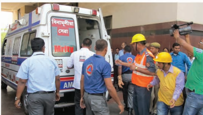
Victims being taken by the Ambulance