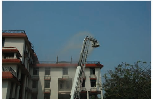
Fire fighting being demonstrated by the Fire Services

10 Mobile network were not operational for sometime creating problems in communication between Secretariat Security & 108.