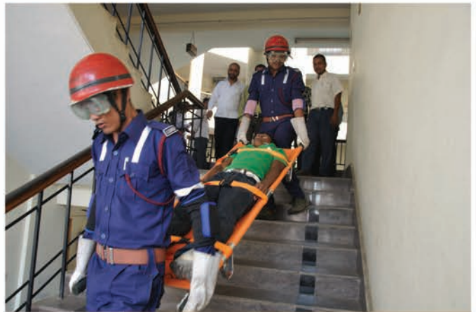
SDRF evacuating a victim out