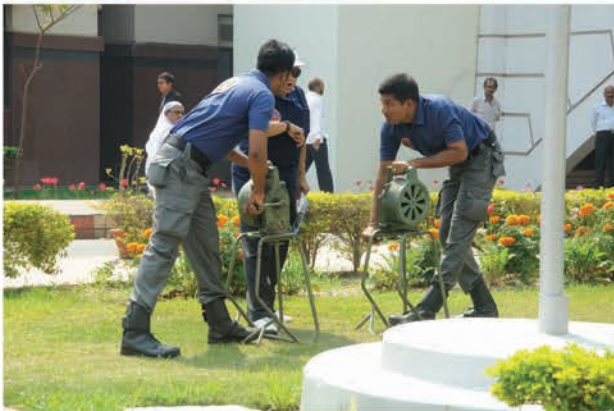
Siren being blown