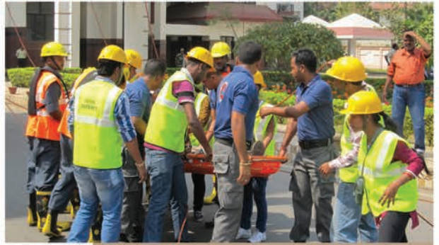
Civil Defence Volunteers taking a victim out