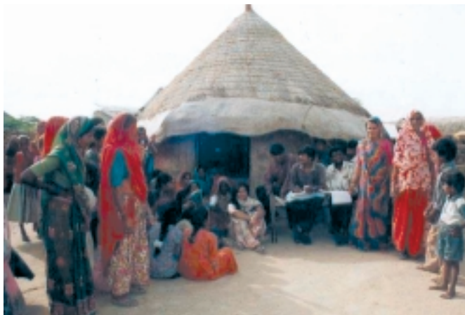
KMVS members meeting with a new artisan group after the earthquake.

Kala Raksha is active in nine villages in Kachch, working with artisans from four marginalized communities – refugees from Nagar Parkar in Sindh, nomadic Rabaris, Islamic pastoral Jatts, and Meghval leather workers. The organization focuses on three areas: income generation through traditional skills, basic education and preventive health care. It brings together artisans, community members and experts in the fields of art, design and museums to improve skills and maintain the quality of highly developed craft traditions. Kala Raksha encourages its artisan cooperatives to participate in all stages of design, production