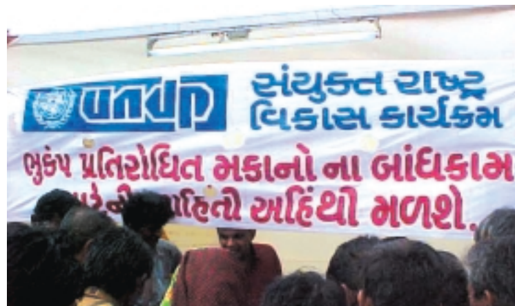
“Information on seismically safe construction of houses is available here”: a UNDP banner at a temple fair in Bhachau in Kachch district.

Advocacy: The setus have identified a range of rehabilitation issues and voiced them at appropriate forums for resolution. People in Boladi village, for example, were using schoolrooms to store fodder. The teacher no longer came to the school because there were no arrangements for room and board. In talking to the villagers, a setu team discovered however that they were keen to send their children to school and willing to provide the teacher with housing and food arrangements. Enlisting the participation of the villagers and serving as a liaison between them and the teacher, the setu has helped to reopen the school.