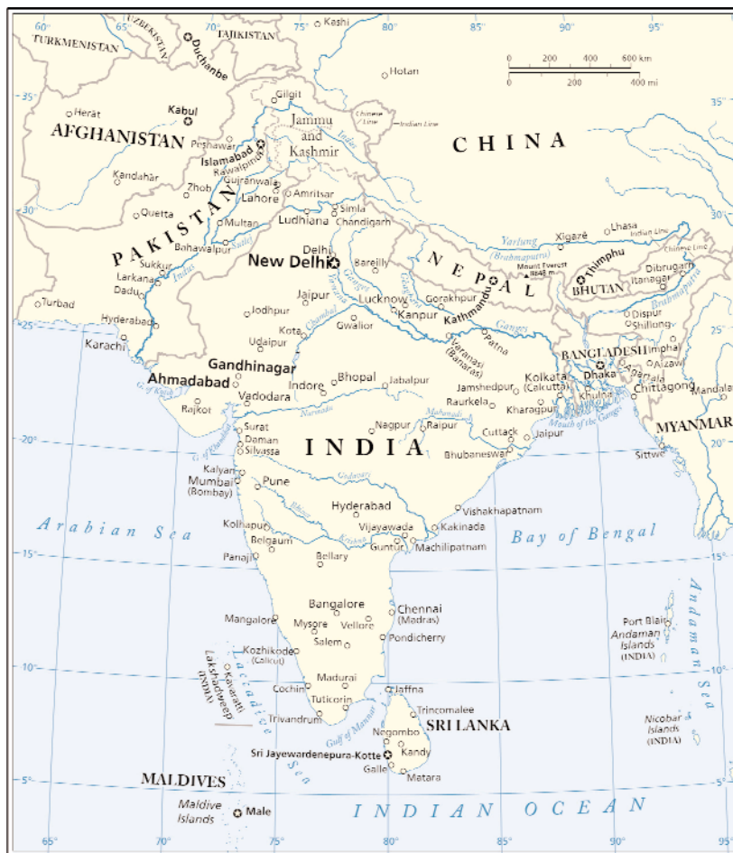
Gandhinagar is the capital of Gujarat.

The boundaries and names shown and the designations used on this map do not imply official endorsement or acceptance by the United Nations. Dotted line represents approximately the Line of Control in Jammu and Kashmir agreed upon by India and Pakistan. The final status of Jammu and Kashmir has not yet been agreed upon by the parties.